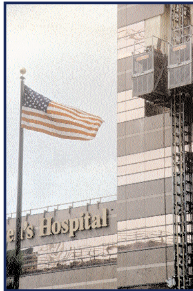
Photo of a Champion Elevator installation during remodeling and expansion of the Texas Children's Hospital building in Houston.

Assuring safety and conformance to the codes and regulations fall into two very different types of engineering analyses. Safety assurances of the elevator — essentially measuring maximum stresses and ensuring adequate safety margins — is handled with ANSYS DesignSpace® software for finite element modeling and finite element analysis (FEM/FEA) from ANSYS Inc.