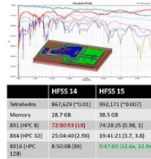
Spectral decomposition technology in ANSYS Electronics HPC provides more efficient interpolation sweeps for USB electronic package and PCB.